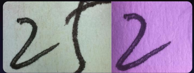
Ink Addition Examination with IR