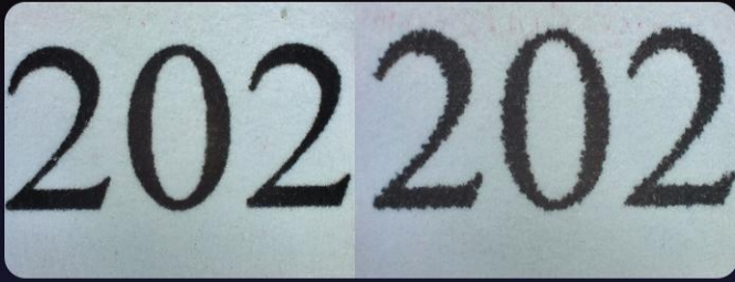
Laser printer Toner Inkjet printer printed text

With Miscope which with 40x and 140x magnification, you could see more details of the articles